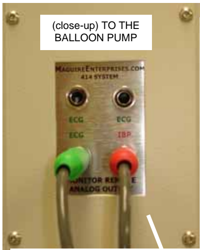
(close-up) FROM THE MONITOR